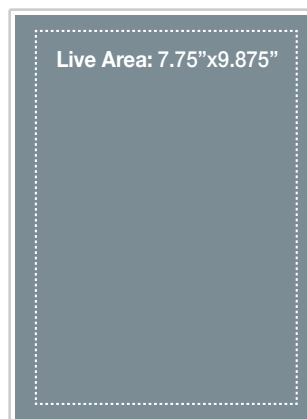
Full Page with Bleed 8.75"x11.125"